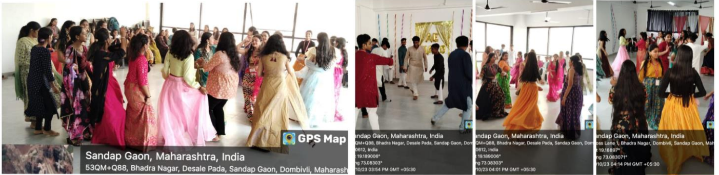
Students Participated in Garbha