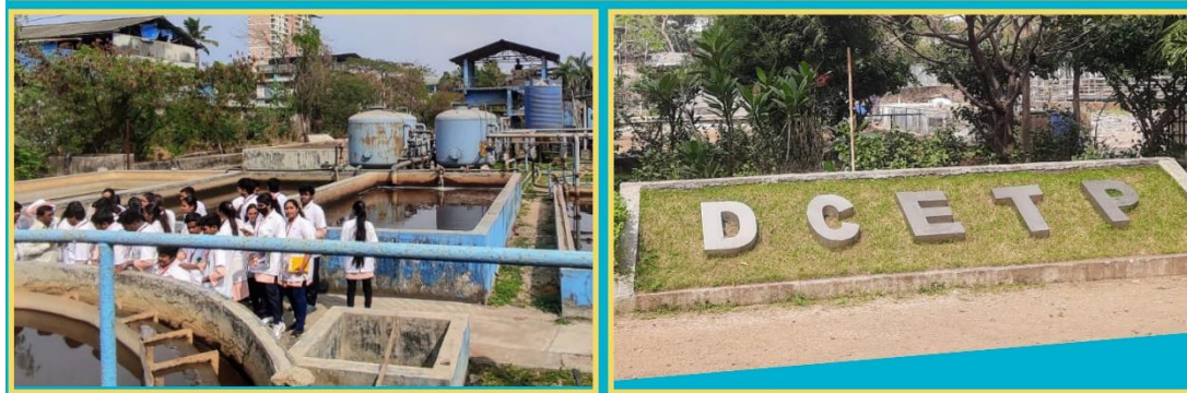
Glimpses of site visit at DCETP