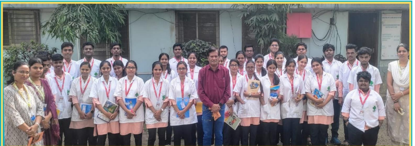
Students of at Common Effluent Treatment Plant, Dombivli