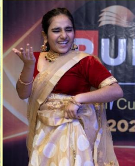
Glimpses of Skit, Group Dance, Fashion Show etc.