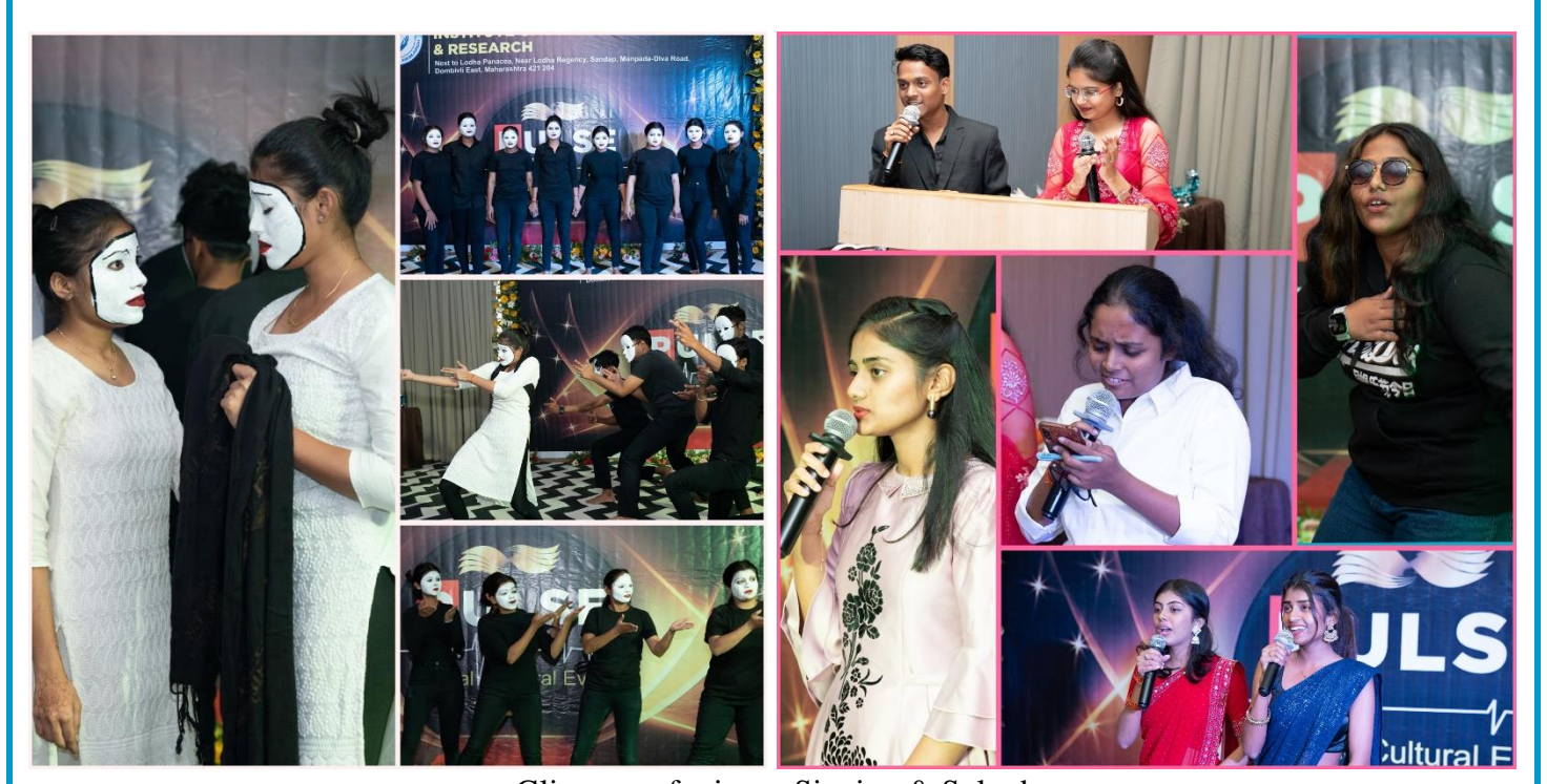
Glimpses of mimes, Singing & Solo dance