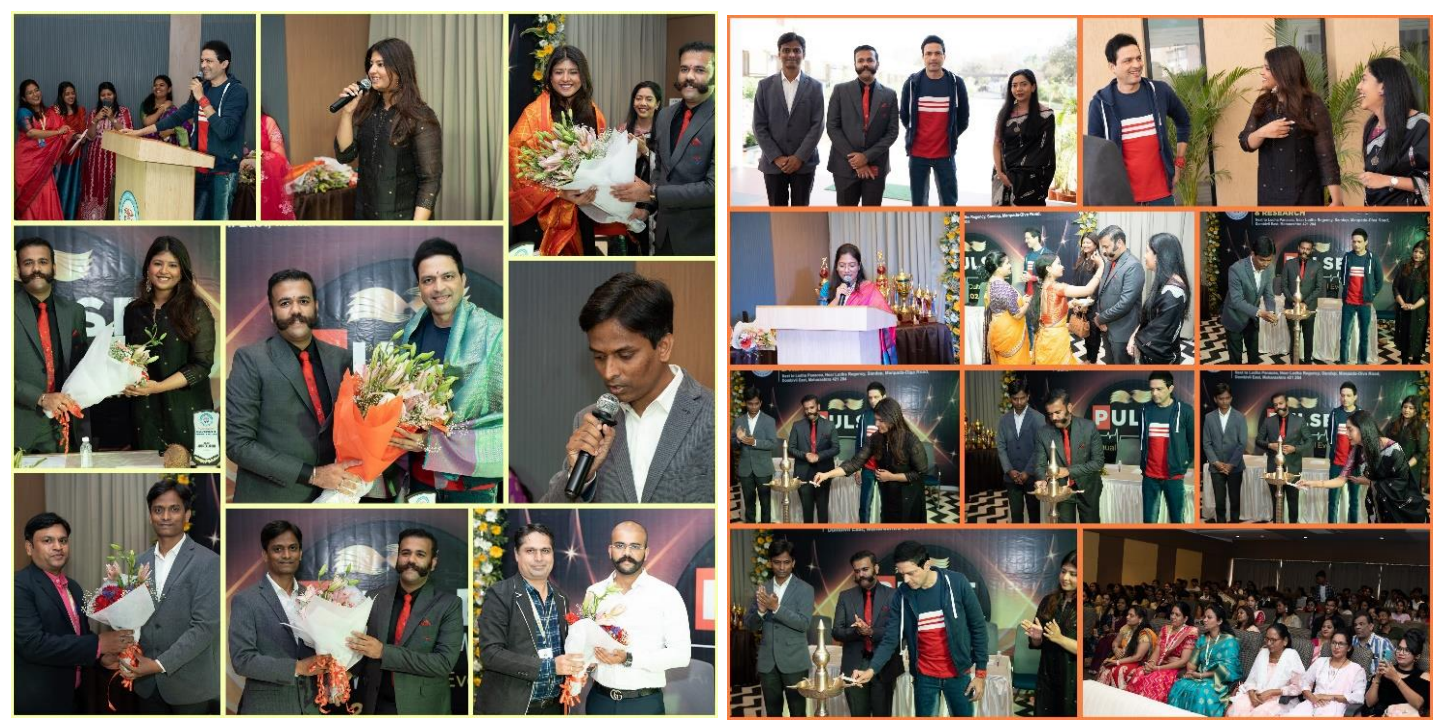
Welcome of guests & Inauguration of Event

The event was a vibrant tapestry of student performances, showcasing a diverse range of arts from dance and singing to mime and skits.