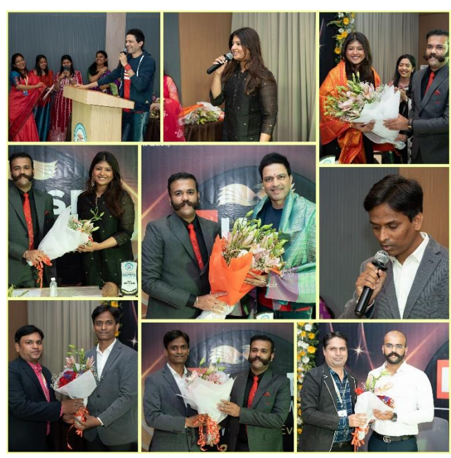
Welcome of guests & Inauguration of Event