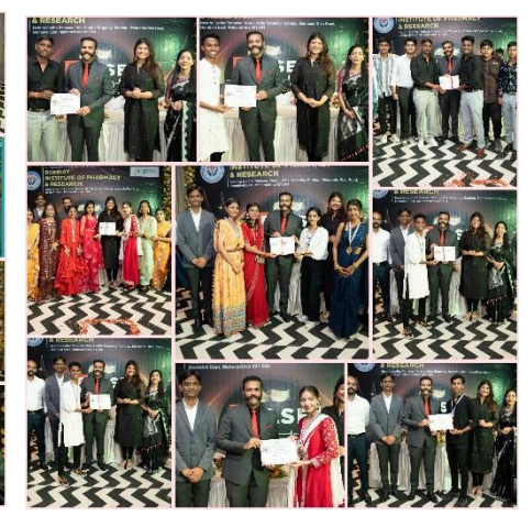
Prize distribution Events organized on 09th March, 2024