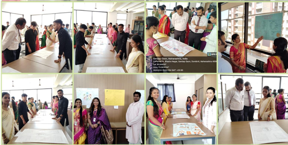
B. Pharmacy & D. Pharmacy Participants in Poster Presentation