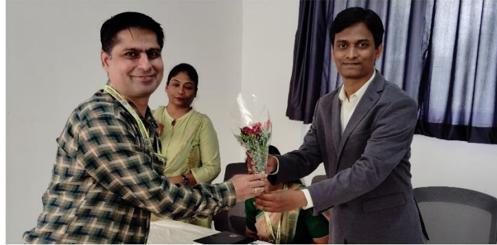
Appreciation of exam rankers in parent teacher meeting & Interaction of parents with guardian teachers & Subject Teachers

Parents interacted with the subject teachers & guardian teacher during which progress of the students were understood & discussion was made on various aspects to improve overall performance of students.