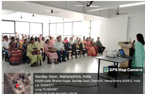
Address by Principal, Exam In-charge & all the parents present for meeting