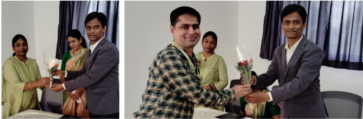
Wel-come of parent's representative