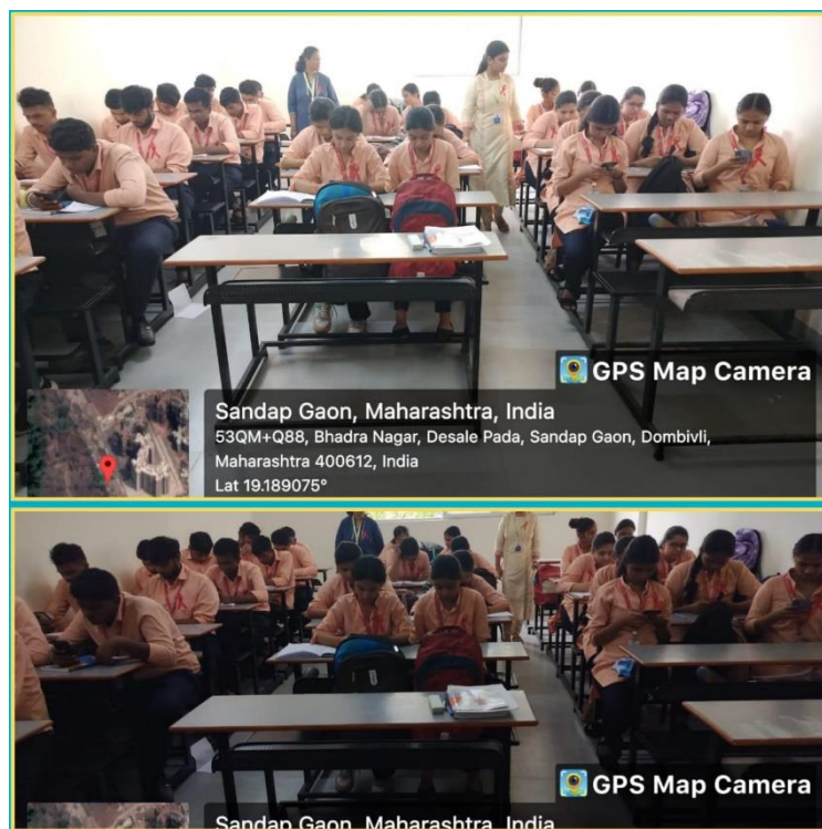
Participation by students in the Survey on AIDS awareness