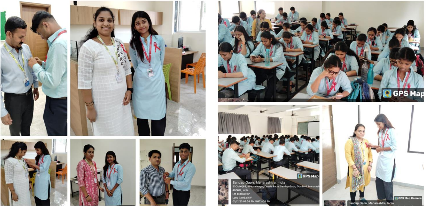
Glimpses of campaign by students, teachers & non-teaching staff